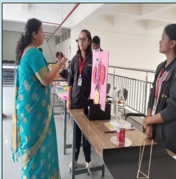
Principal in discussion with the students at the exhibition