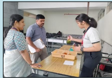
Students Performing Science Experiments