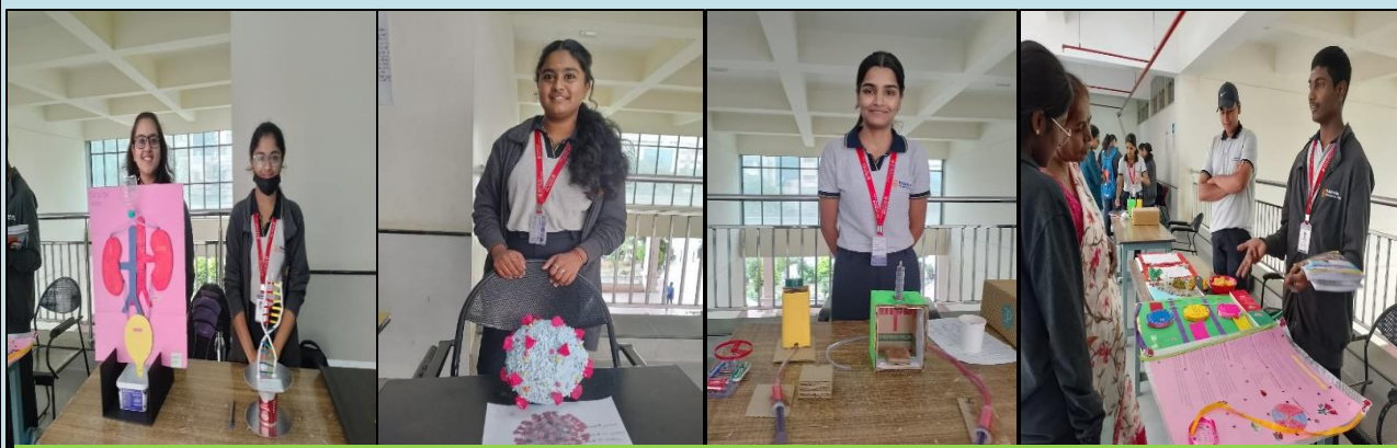
3-D models being displayed by the students